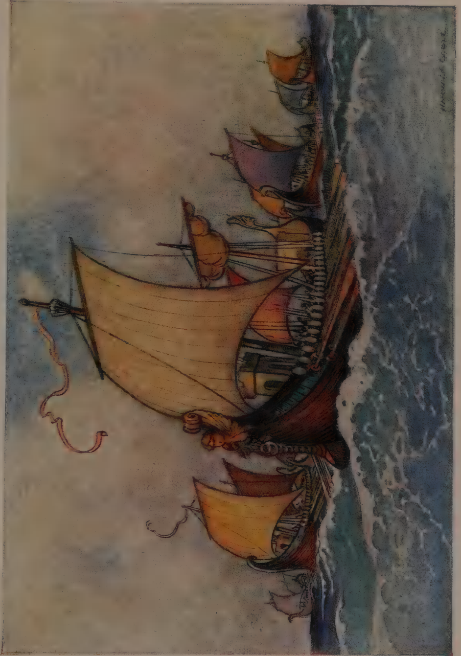
THE GREEK FLEET